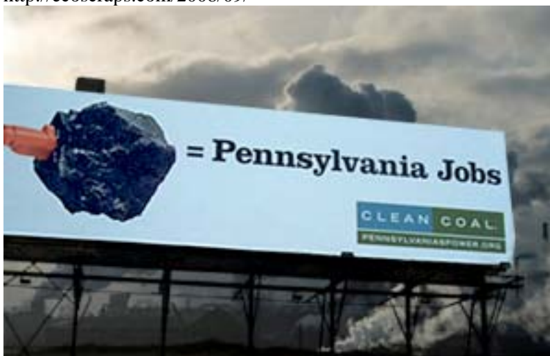
America's Power billboard http://www.salon.com/news/feature/2008/05/15/coal_marketing/